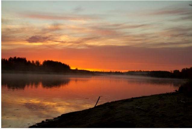
Sunset in the Land of the Midnight Sun.